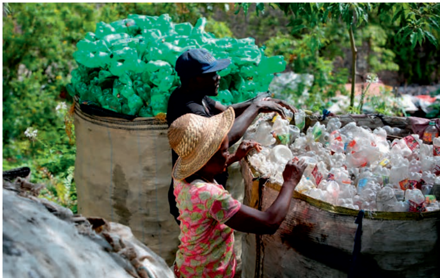
Community collection for bottles in Haiti

The major portion of OBP is PET, which is the most common polyester and is used in fibers clothing, bottles and containers for liquids and foods, as well as in combination with glass fiber for engineering resins. Most of the world's PET production is for synthetic fibers (more than