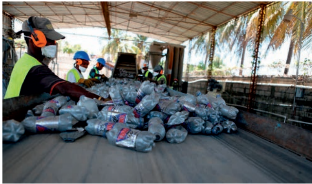
Fig. 1. Initial factory used at the start of the project to process Ocean-bound Plastics (OBP)

why injection-molded flame retarded PBT parts have found numerous applications in E&E equipment, more recently also in e-mobility, e.g. for high voltage connectors in signal orange color (RAL 2003).